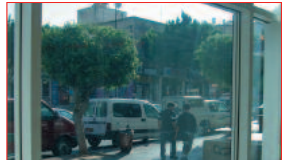
The No-Bar System provides virtually invisible protection to your storefront's windows.